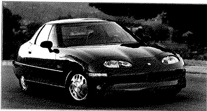
MANUFACTURER: General Motors PRODUCT OFFERING: EV1

AVAILABILITY: 1997 model year in Los Angeles, San Diego, Phoenix, and Tucson markets VEHICLE TYPE: Two-passenger car EMISSION CLASSIFICATION: Federal Clean Fuel Fleet; California ZEV/ILEV POWERTRAIN: 102-kW (137-hp), three-phase, liquid-cooled AC induction motor DRIVETRAIN: FWD TRANSMISSION: Fixed ratio transaxle FUEL CAPACITY: 16.2 kW, Delphi Energy Systems 312-V recyclable lead-acid battery pack MULTI-FUEL: No — dedicated SPECIAL MAINTENANCE: None WARRANTY: Full OEM through Saturn dealers ADDITIONAL COSTS: Contact Saturn dealers for information NO. OF UNITS PLANNED: Depends on orders received COMMENTS: Standard antilock brakes, driver and passenger airbags, daytime running lamps, air conditioning; offboard Delco Electronics Magne-Charge inductive charger rated 6.6 kW at 156-260 VAC; estimated range: 90 miles highway, 70 miles city ORDERING INFORMATION: Call 1-800-25ELECTRIC